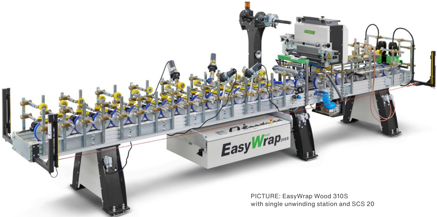
PICTURE: EasyWrap Wood 310S with single unwinding station and SCS 20